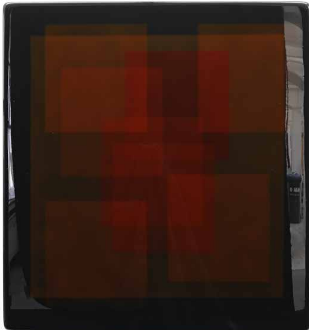
DIRK SALZ DSA/M 1177 # 2878, 2023, RESINWORKS / DEEP DIVES, PIGMENTS AND RESIN ON MULTIPLEX 100 X 90 X 8 CM SIGNATURE ON REVERSE