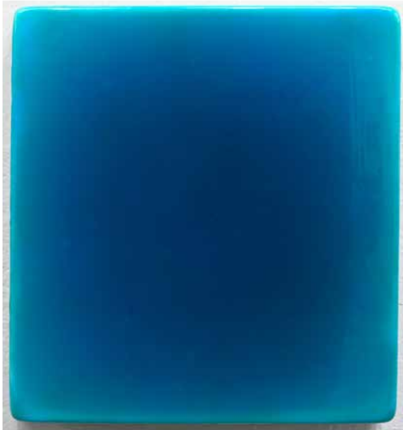
DIRK SALZ DSA/M 1261 # 2961, 2024, RESINWORKS / FADINGS, PIGMENTS AND RESIN ON MULTIPLEX 44 X 40 X 7 CM