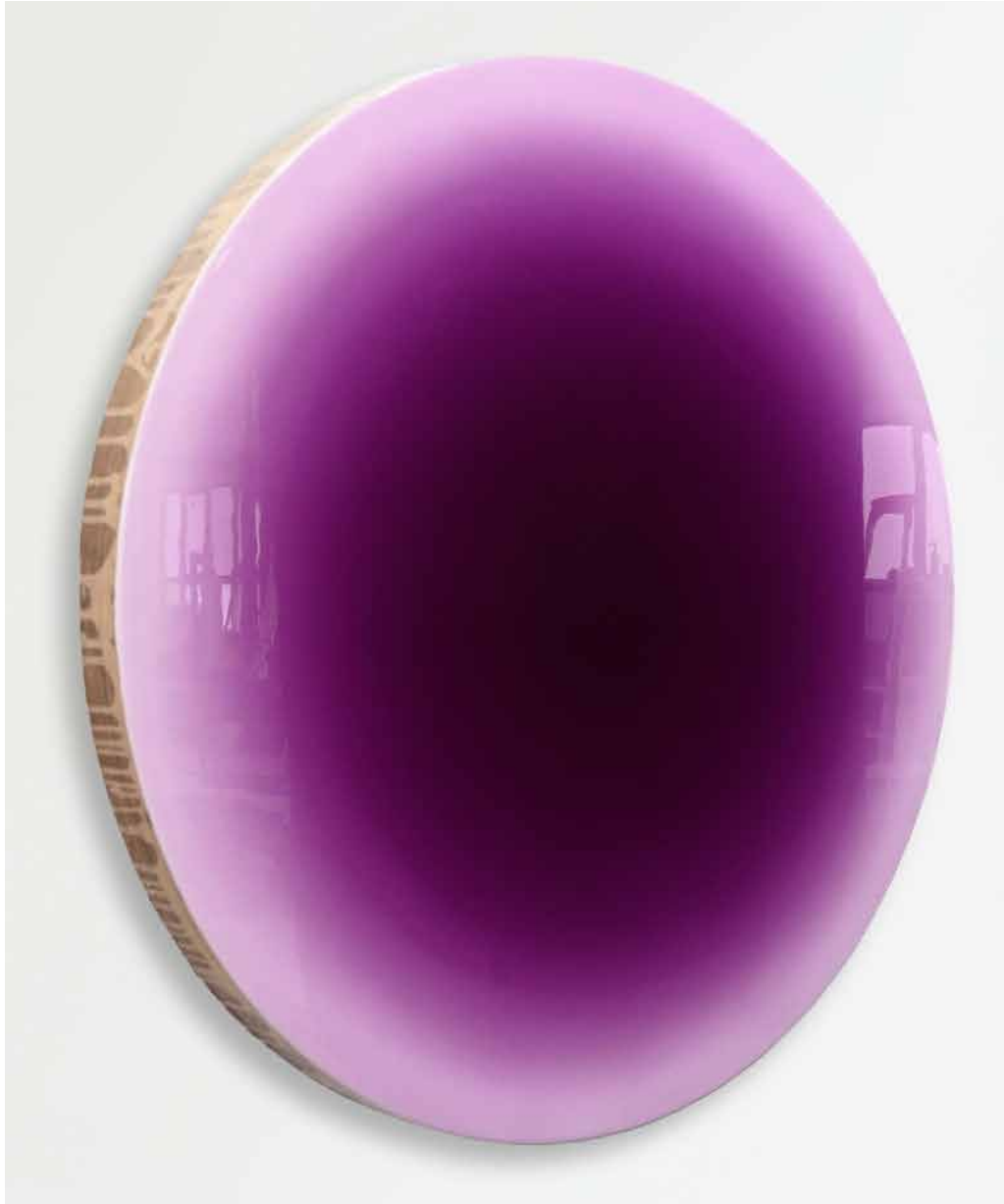
DIRK SALZ DSA/M 1159 # 2866, 2023, RESINWORKS / FADINGS, PIGMENTS AND RESIN ON MULTIPLEX T=6, Ø90CM SIGNATURE ON REVERSE