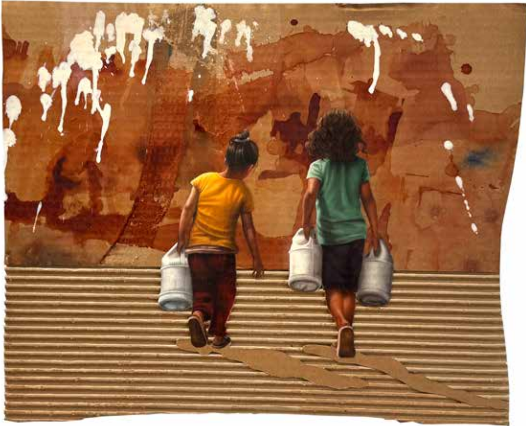
Maria Torp Fetching Water, 2024 Size: 45 x 55 cm without frame Acrylic, oil on cardboard Oakframe with finger braided joints, museum glass