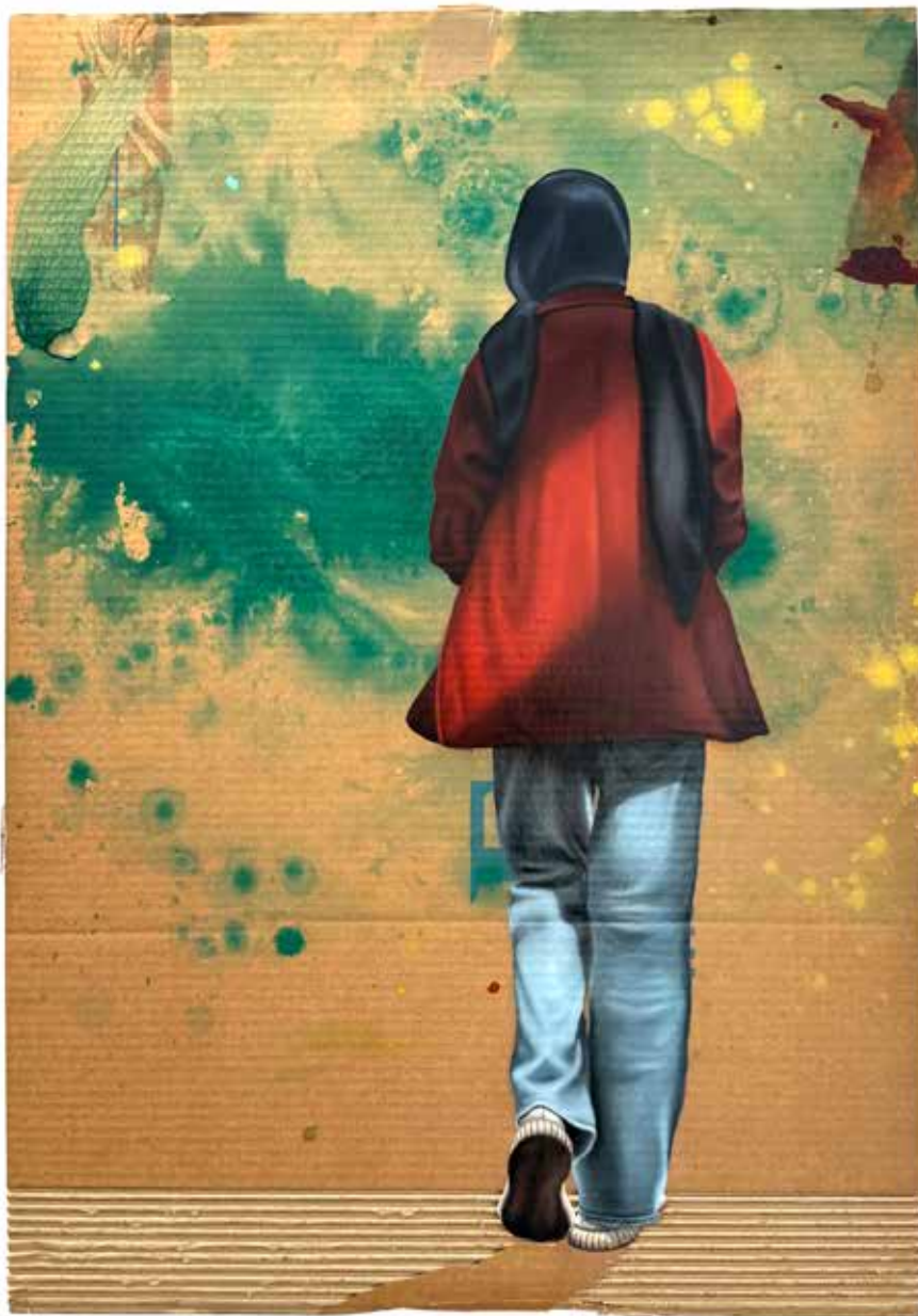
Maria Torp From The River, 2024 Size: 103 x 71,5 cm without frame Acrylic, oil on cardboard Oakframe with finger braided joints, museum glass