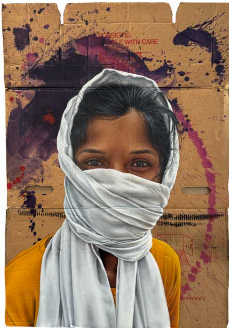
Maria Torp Hope, 2024 Size: 99 x 71 cm without frame Acrylic, oil on cardboard Oakframe with finger braided joints, museum glass