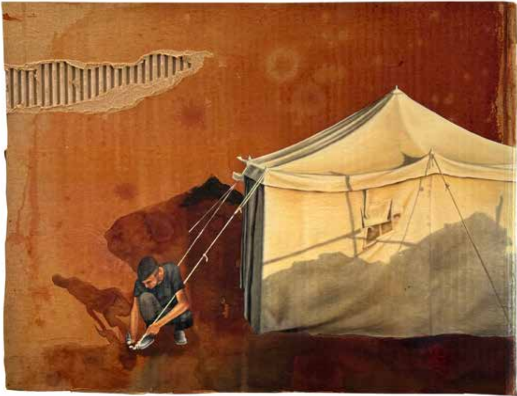
Maria Torp Tent, 2024 Size: 44 x 59 cm without frame Acrylic, oil on cardboard Oakframe with finger braided joints, museum glass