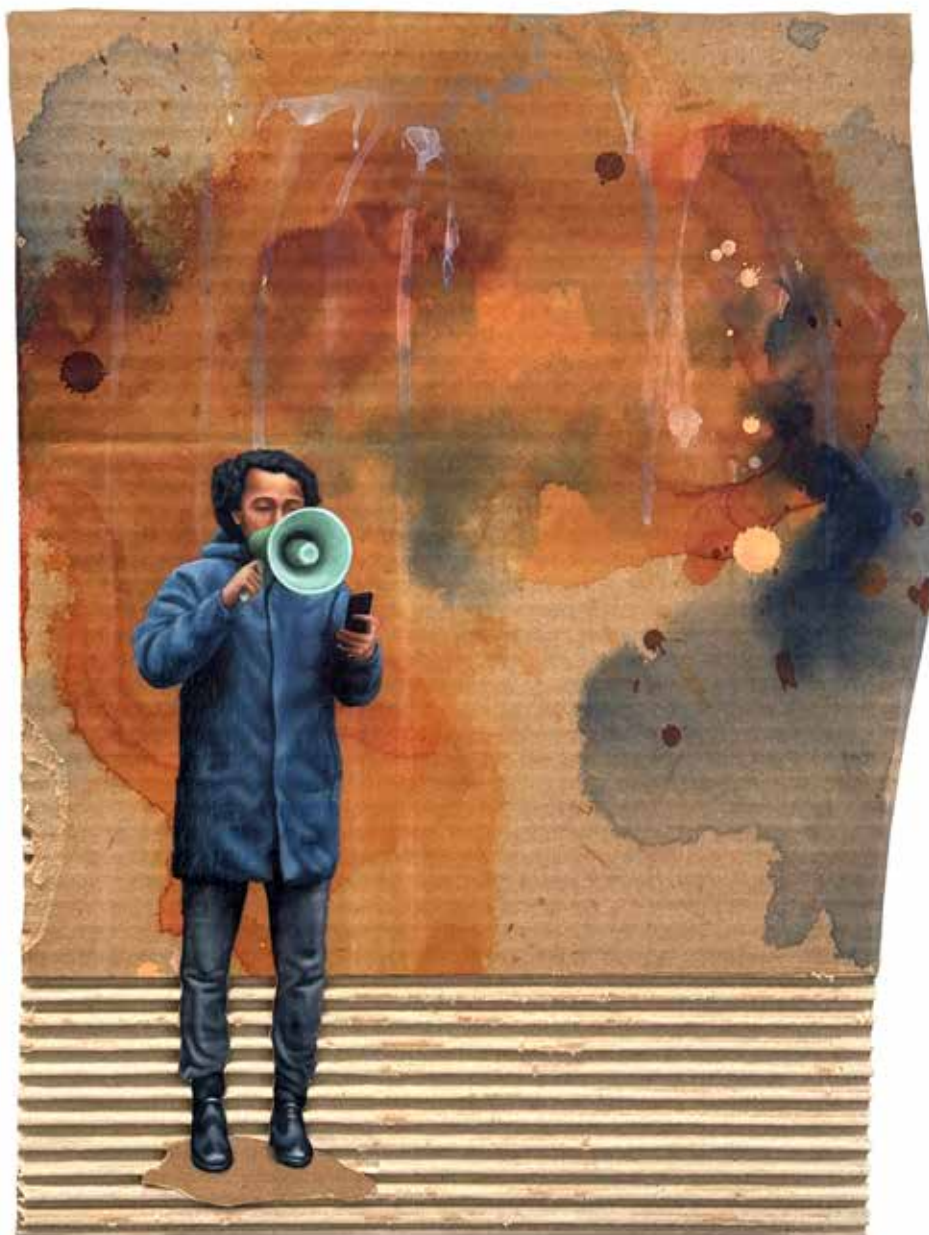
Maria Torp Word, 2024 Size: 44 x 33 cm without frame Acrylic, oil on cardboard Oakframe with finger braided joints, museum glass