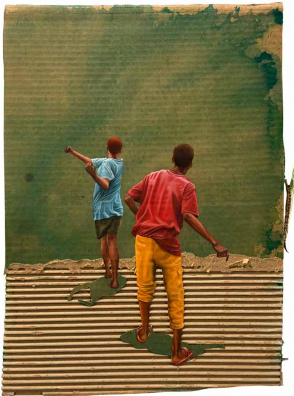
Maria Torp Stones, 2024 60 x 42,5 cm Acrylic, oil on cardboard Oakframe with finger braided joints, museum glass