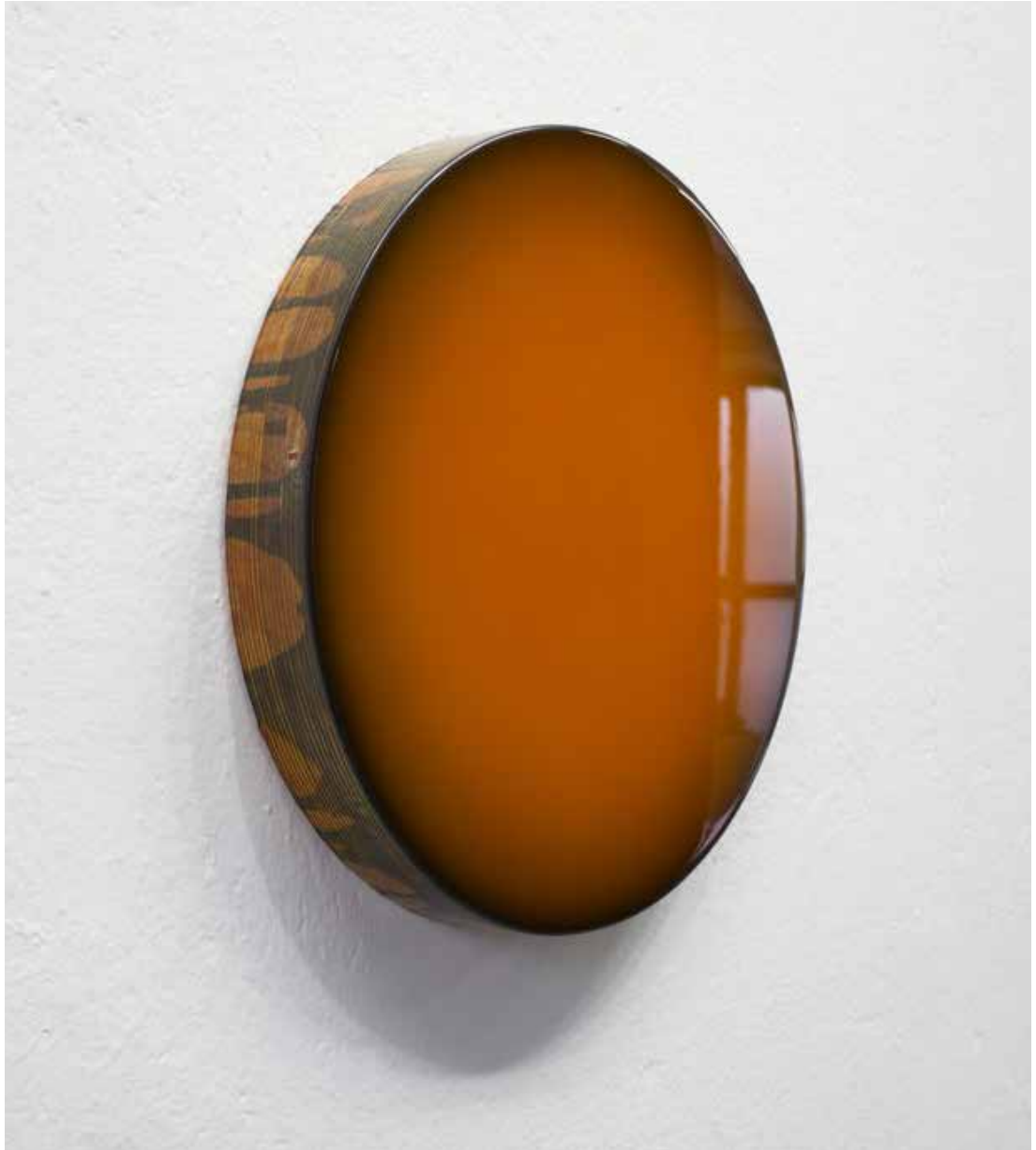
DSA/M 1306 # 3007, Resinworks / Fadings, pigments and resin on multiplex t = 6, Ø 40 cm Signature: signature on reverse