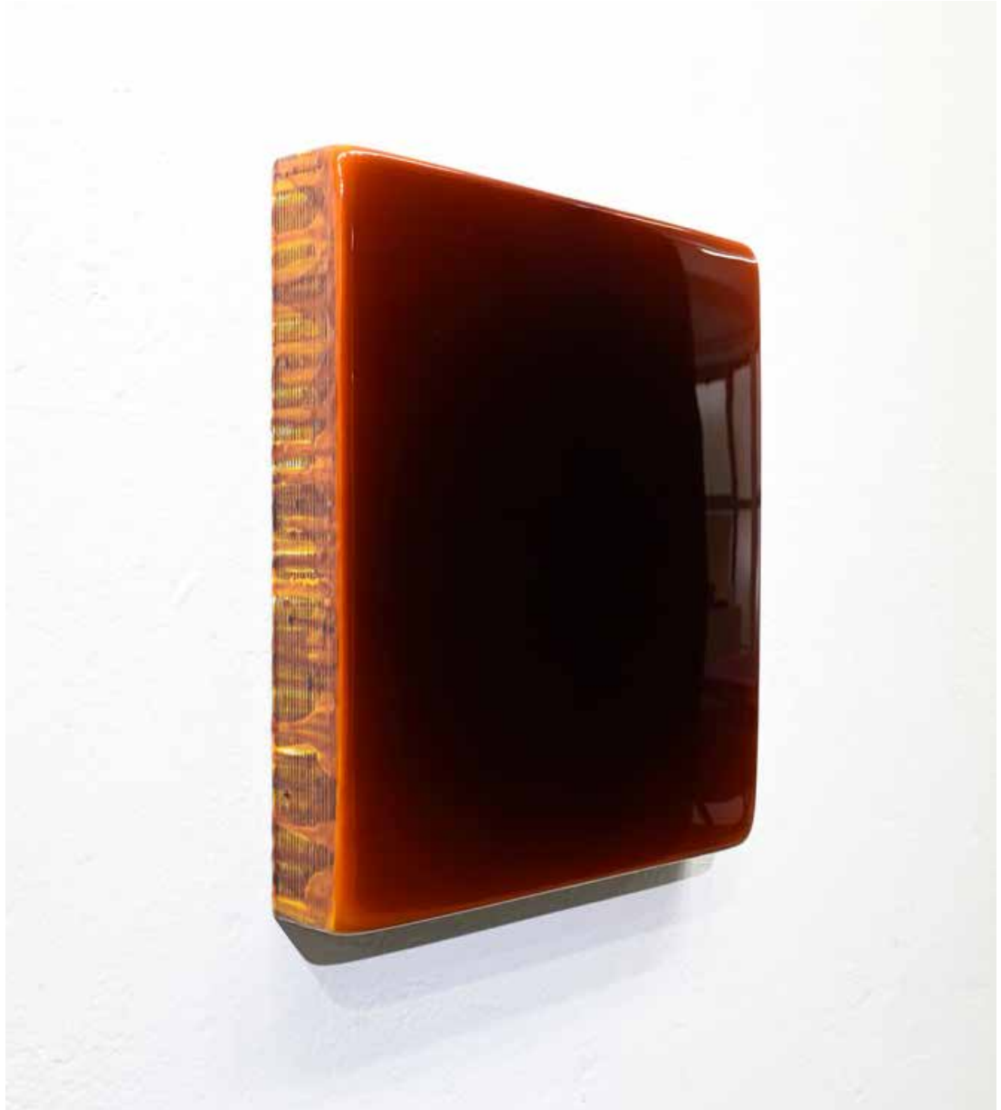
DSA/M 1251 # 2954, Resinworks / Fadings, pigments and resin on multiplex 44 x 40 x 7 cm Signature: signature on reverse