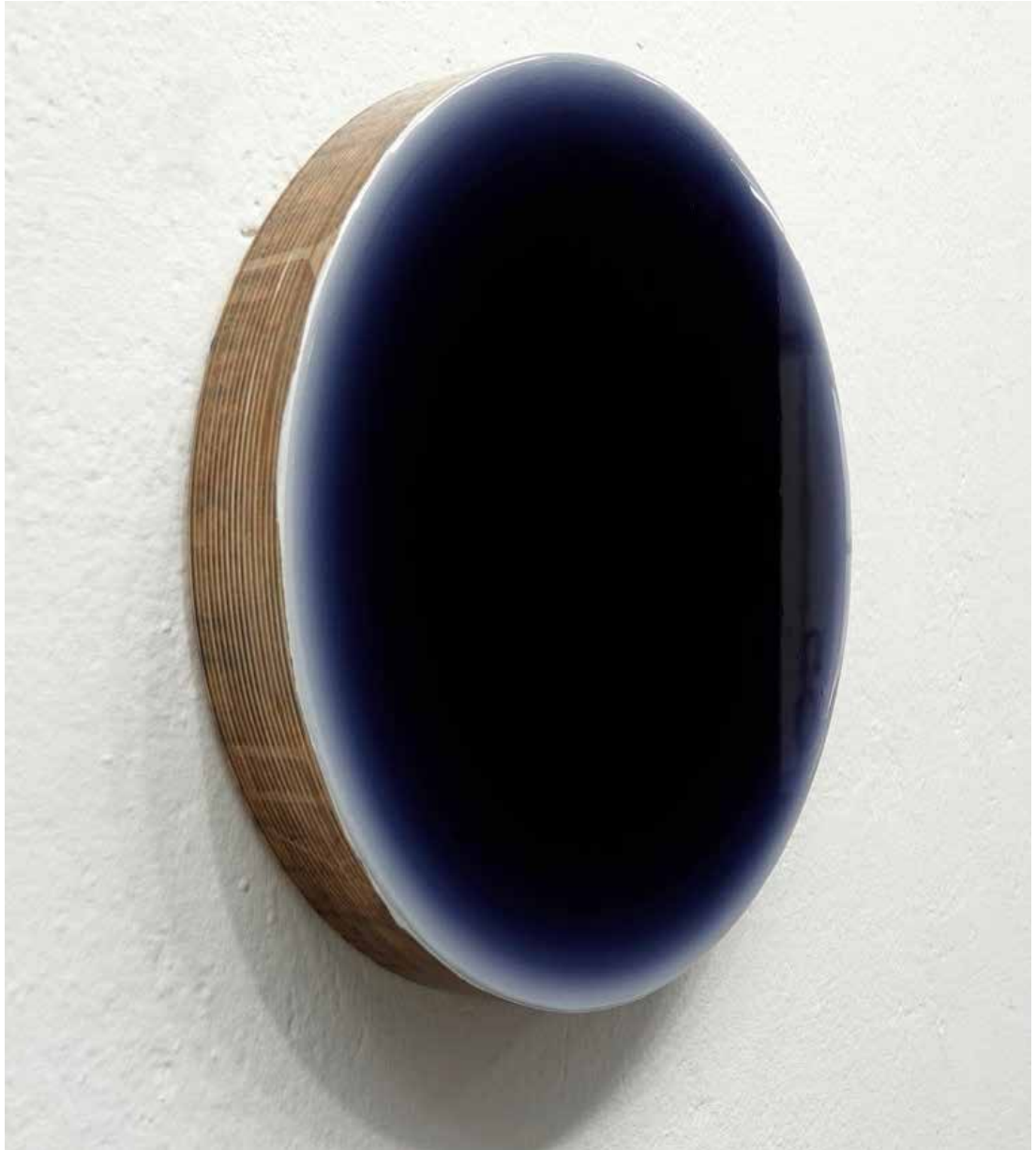
DSA_M_1346 Resinworks / Fadings, pigments and resin on multiplex t = 6, Ø 40 cm Signature: signature on reverse