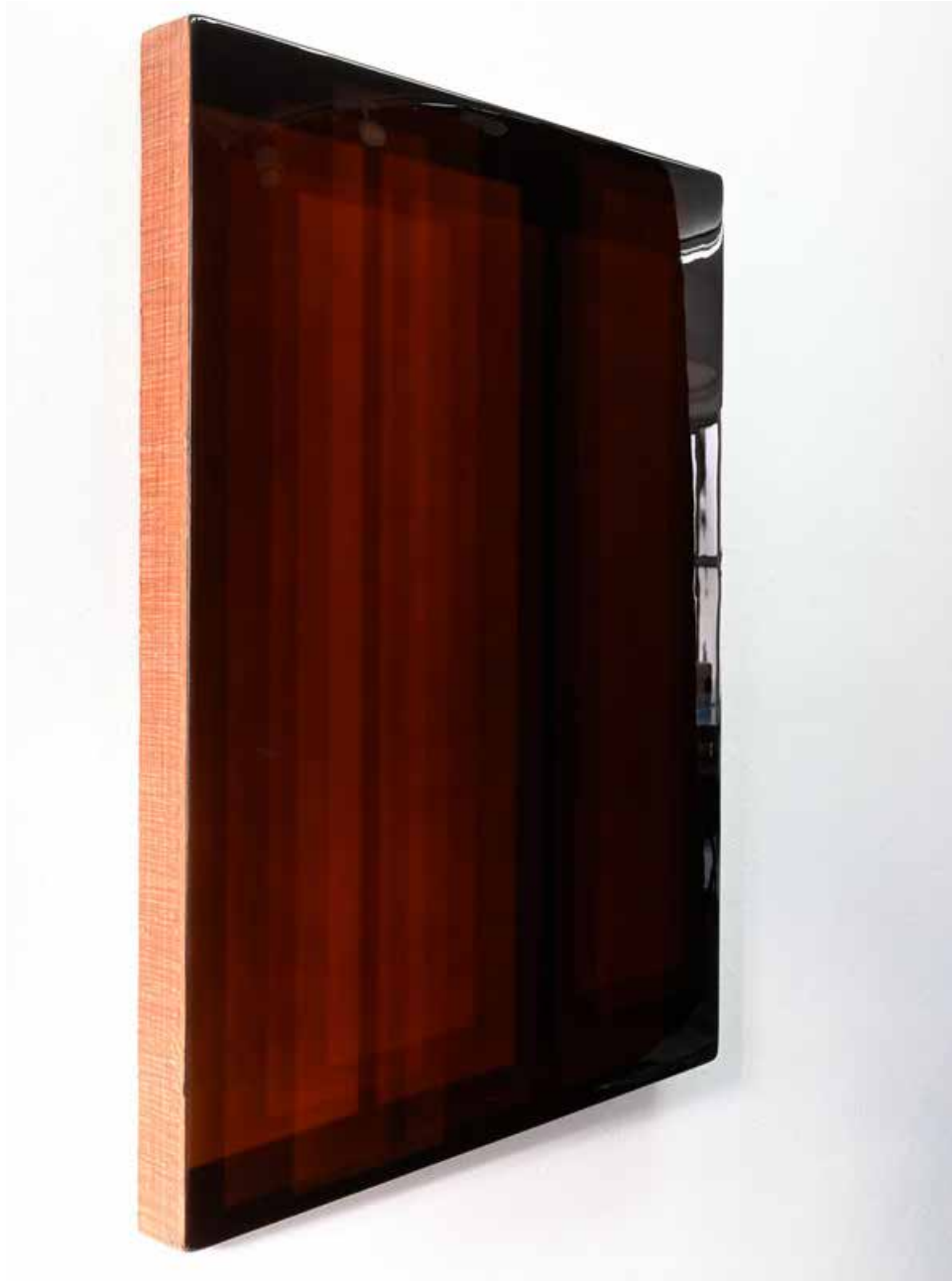
DSA/M 1232 # 2933, Resinworks / deep dives, pigments and resin on multiplex 140 x 100 x 12 cm Signature: signature on reverse