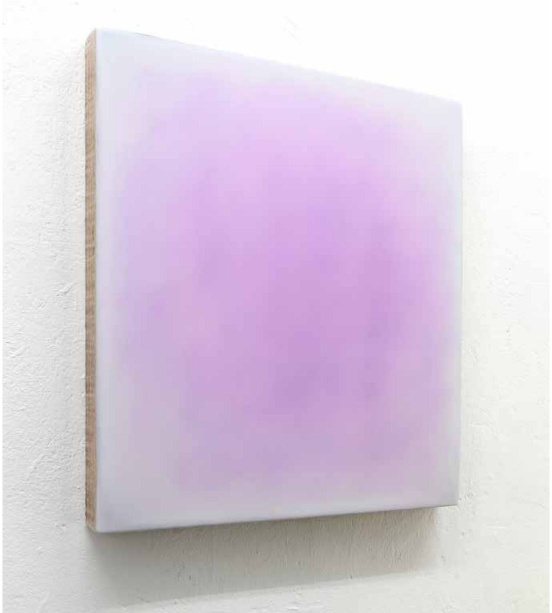
DSA/M 988 # 2692, Resinworks / fadings / matte series, pigments and resin on multiplex 82.5 x 75 x 8 cm Signature: signature on reverse