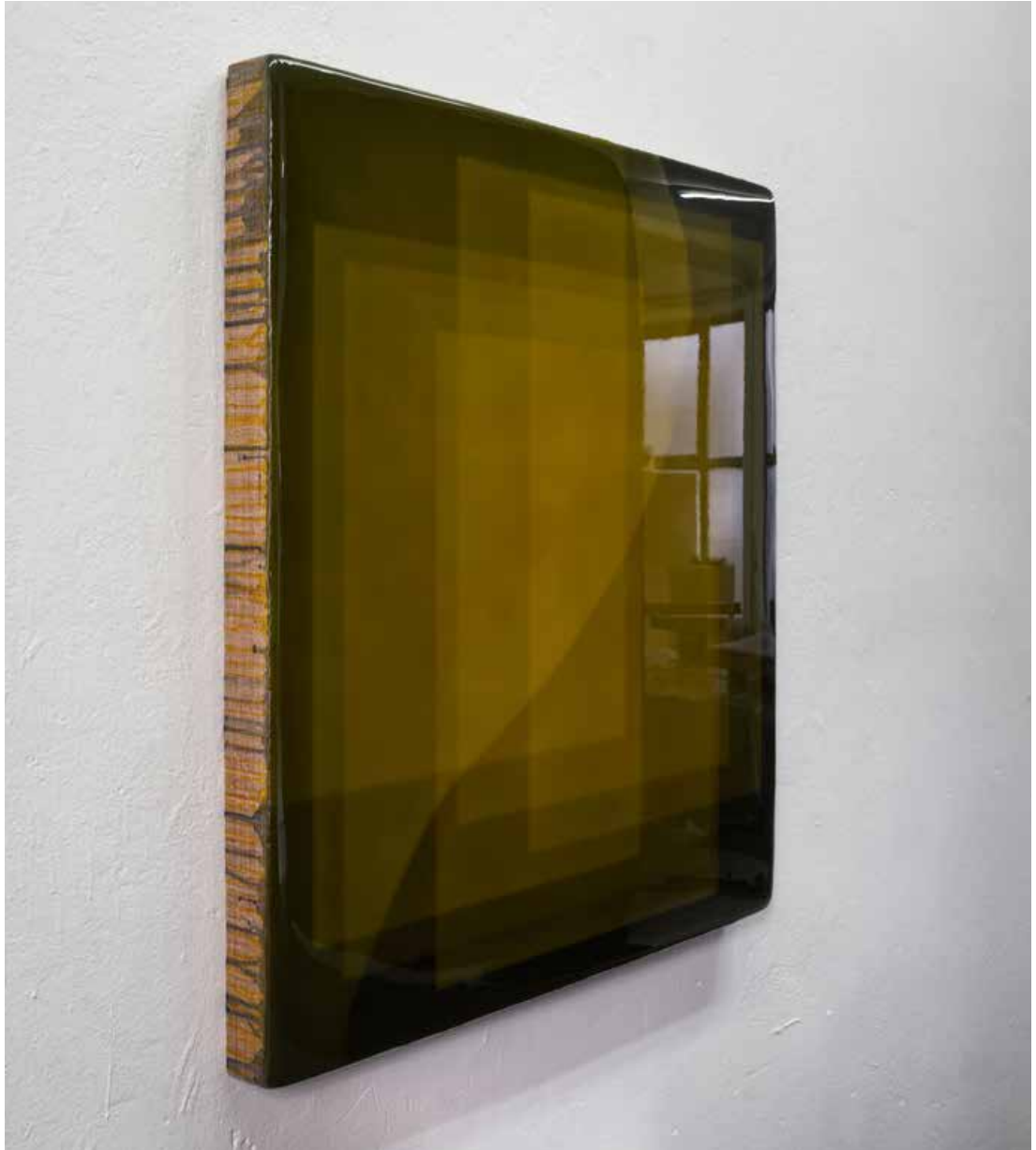
DSA/M 1329 # 3030, Resinworks / deep dives, pigments and resin on multiplex 100 x 90 x 8 cm Signature: signature on reverse