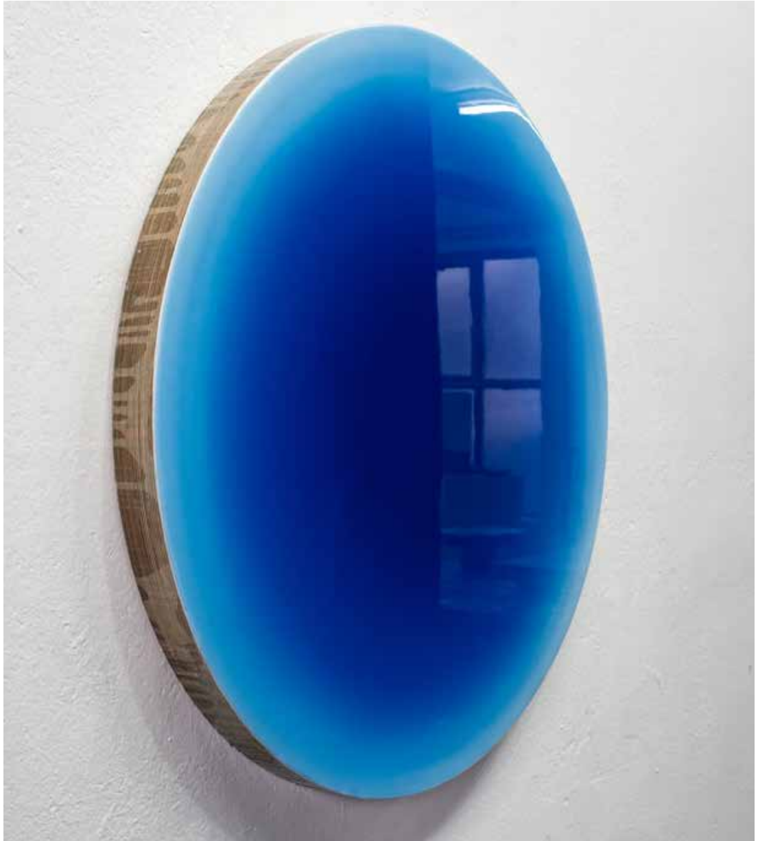
DSA/M 1337 # 3042, Resinworks / Fadings, pigments and resin on multiplex t = 6, Ø 90 cm Signature: signature on reverse