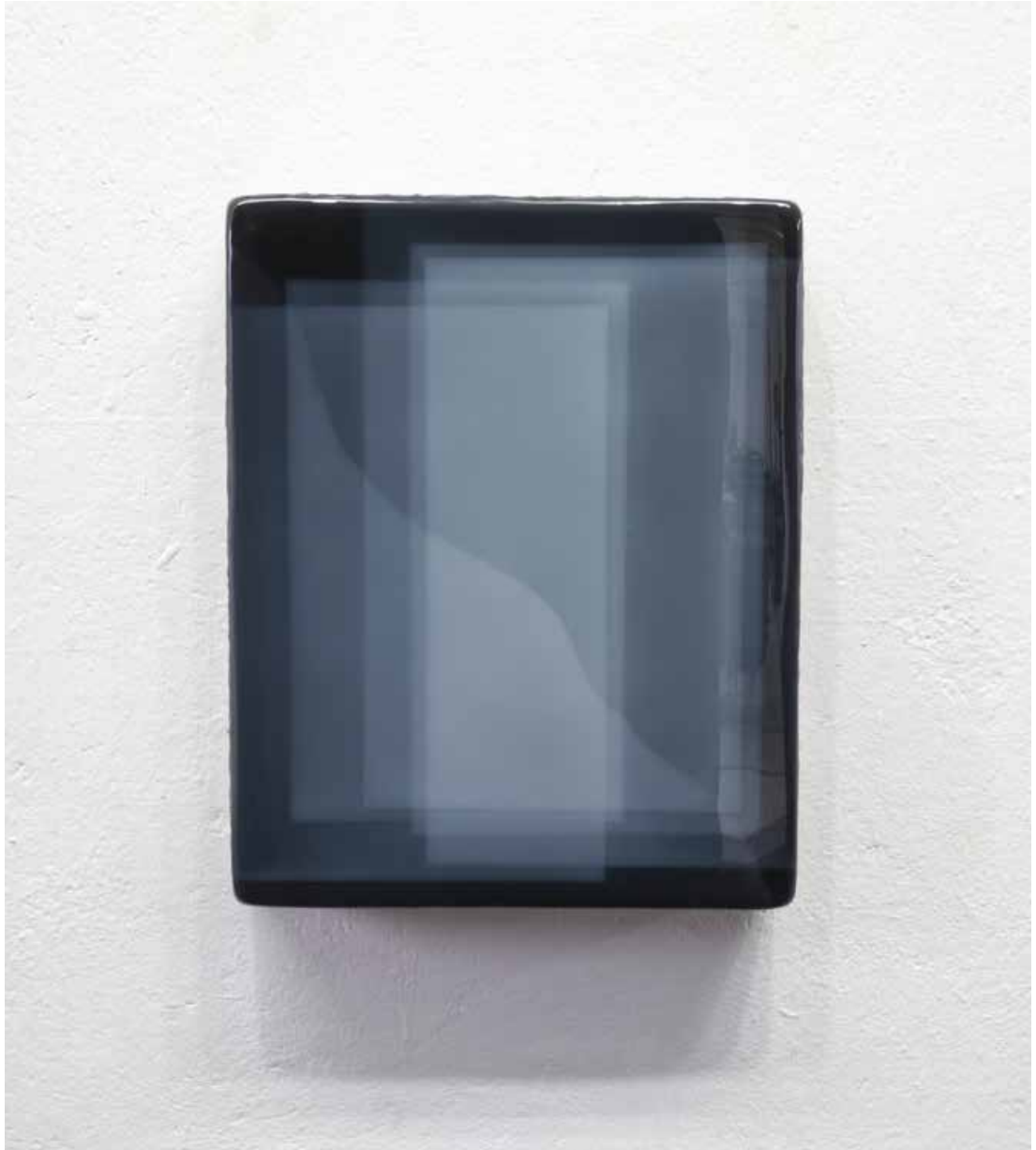
DSA/M 1340 # 3035, Resinworks / deep dives, pigments and resin on multiplex 48 x 38 x 12 cm Signature: signature on reverse