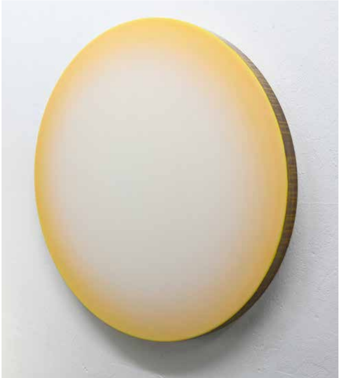
DSA/M 828 # 2616, Resinworks / Fadings / matte series, pigments and resin on multiplex t = 6, Ø 120 cm Signature: signature on reverse