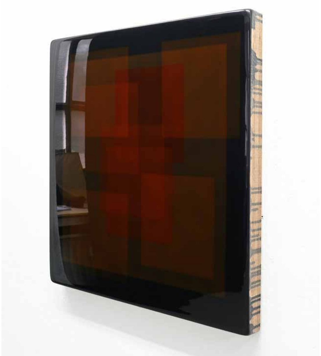
DSA/M 1177 # 2878, Resinworks / deep dives, pigments and resin on multiplex 100 x 90 x 8 cm Signature: signature on reverse