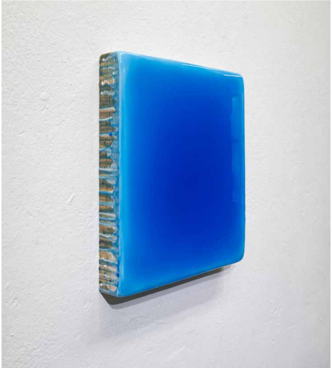
DSA/M 1333 # 3038, Resinworks / Fadings, pigments and resin on multiplex 44 x 40 x 7 cm Signature: signature on reverse